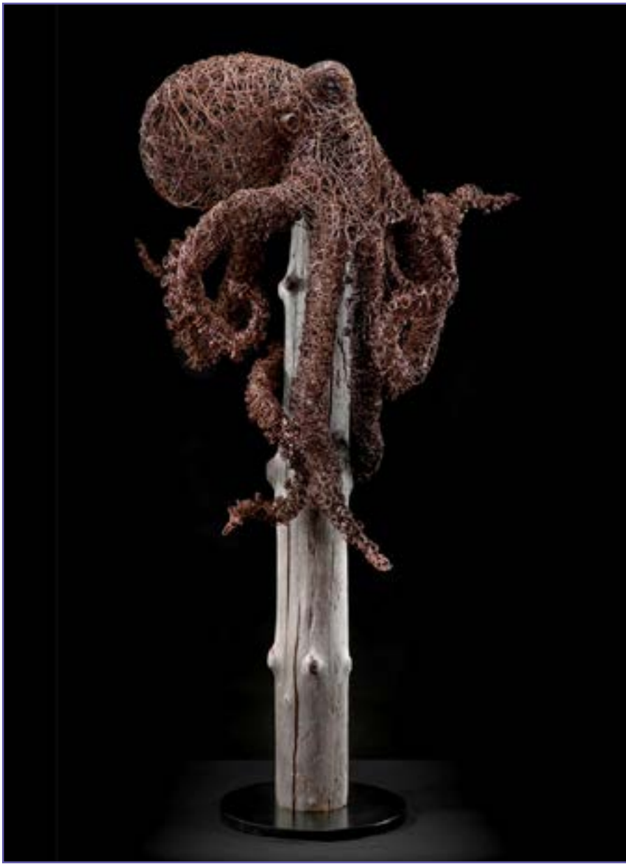
Fluid Motion , wire sculpture by Mark Holme